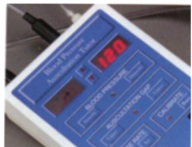
Adjustable pulse rate