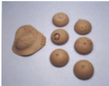
7 interchangeable breasts