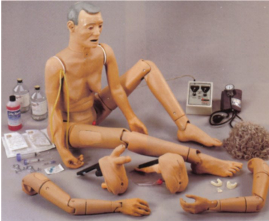
Patient Care: Adult

Adult Patient Care – Pediatric & Neonatal Care – Auscultation Simulators – Injection & Infusion Trainers – Skills Trainers – Interactive Emergency Care – Multicode Simulators – Airway Trainers – CPR Trainers – Childbirth Simulators – Maternal & Neonatal Health – Women’s Health – Men’s Health – HIV & AIDS – Anatomic Artwork, Skeletal, Charts