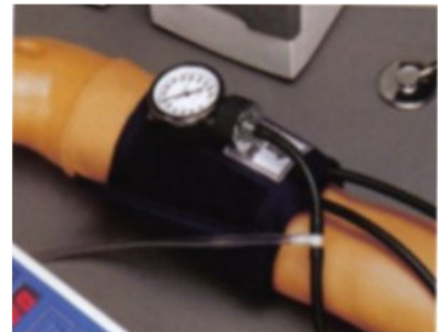
Blood pressure kit