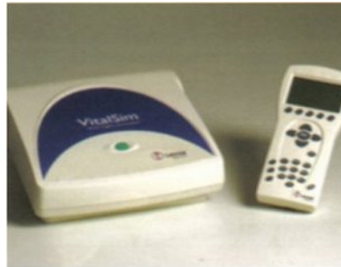
VitalSim - PC